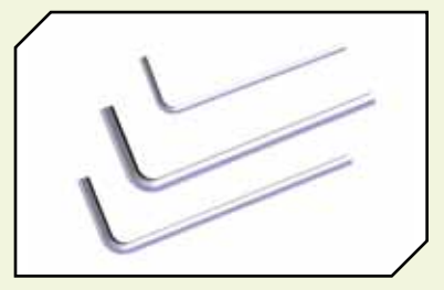
» 3 "L" shaped hex wrenches